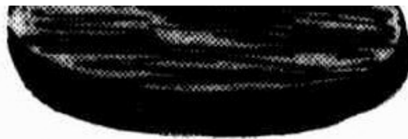
The Smith - Beacon "saucer," seen at Cressy.

So tell us all you can. And GET that picture. It may be worth £1,000 to you.